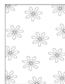
cm 200 x 300 79" x 118"