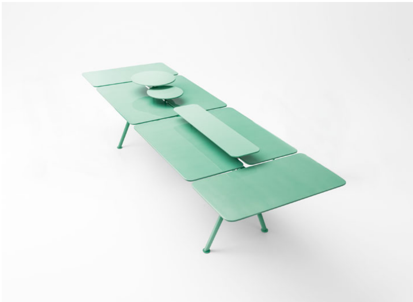
Table with aluminium base, tops and accessories in stoneware.

Base: legs and joints in cast aluminium, central plank under the top in extruded aluminium, all matt or gloss varnished in a colour coordinated with the top. Adjustable aluminium feet.